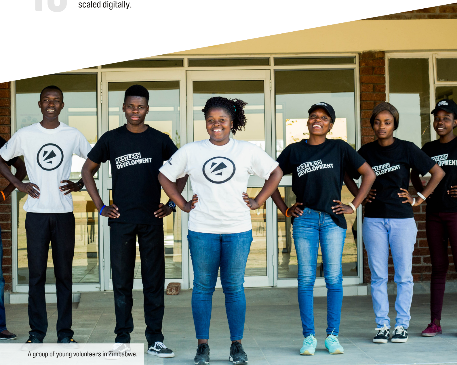
A group of young volunteers in Zimbabwe.

Digital and media have huge untapped potential for Restless Development's models. The agency could start testing how its youth leadership models could be scaled digitally.