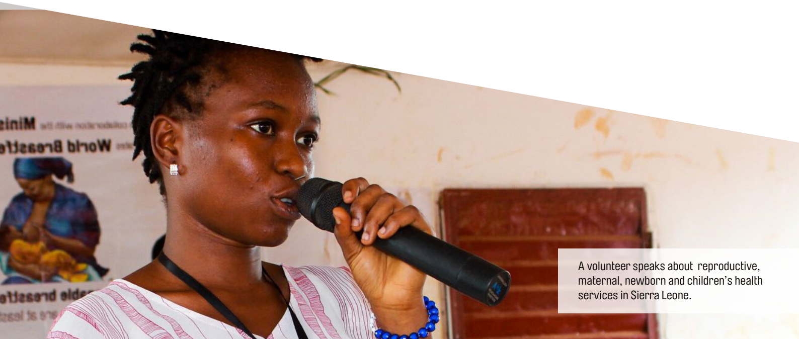
A volunteer speaks about reproductive, maternal, newborn and children’s health services in Sierra Leone.

To provide a clearer direction, Restless Development could carry out a deeper dive into its existing livelihoods work to answer some of the important questions raised by these points and to establish a more consistent approach going forwards.