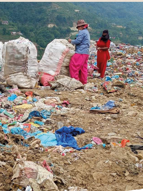
Female waste pickers collecting plastics from the garbage field.

Diarists typically wrote their diaries on paper and submitted entries to rapporteurs using mobile phone apps. Flexible options for diarists whose digital access, connection, or literacy may have inhibited them from a virtually-submitted diary, included audio-based diaries (recorded by the rapporteur through a phone call) or in-person conversations (used for focus group discussions among migrant waste pickers in Indonesia only). Diary entries were supplemented by one-on-one check-ins from rapporteurs, as well as focus group discussions led by rapporteurs at the beginning, middle, and conclusion of the study. Focus group discussions and regular check-ins served to validate data and go deeper on or contextualise certain aspects of diary entries.