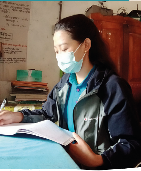
Young diarist in the research process.

To facilitate a youth-led approach to research, 10 young researchers - or 'rapporteurs' - based in Indonesia and Nepal (5 in each country) were assigned to work with each cluster of diarists, guiding them through the research process and monitoring their diary submissions. Rapporteurs were involved in designing the diary question formation, developing options for diary flexibility (written, audio, in-person), and cascading research training to diary writers through instructions and focus group discussions.