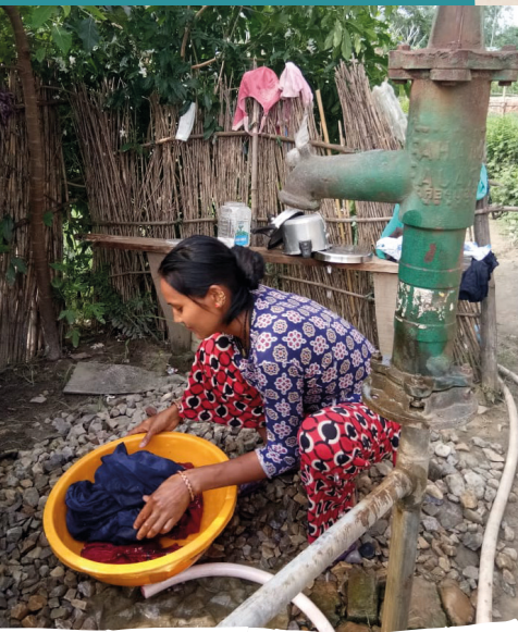
Female homemaker doing her regular household chores.