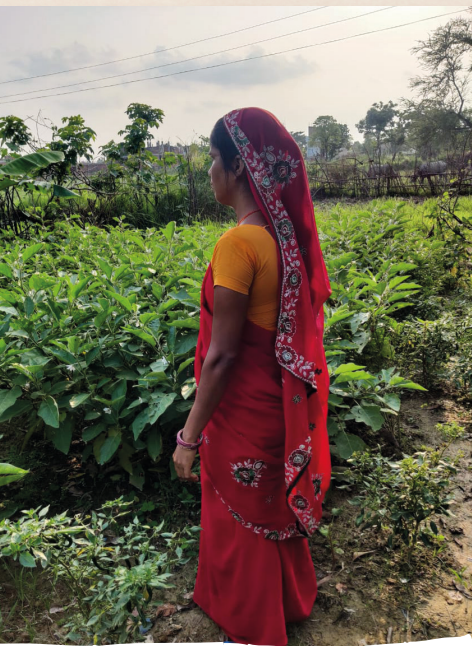
Young female observing her agriculture land.

Students who participated noted the impact of digital literacy on their ability to continue school work remotely and school disruptions pushed diarists to transition into the workforce earlier. Diarists believe they needed to enter jobs at a less skilled level than they would have if the pandemic had not disrupted their studies. The pre-existing discrimination which impedes LGBTIQ students from engaging in school was felt more deeply during pandemic times. Those who identify as 'other' gender reported low involvement with both formal and informal social protection, a product of their lack of integration within mainstream society, and the unequal impacts that can be felt among minority communities who lack strong social capital.