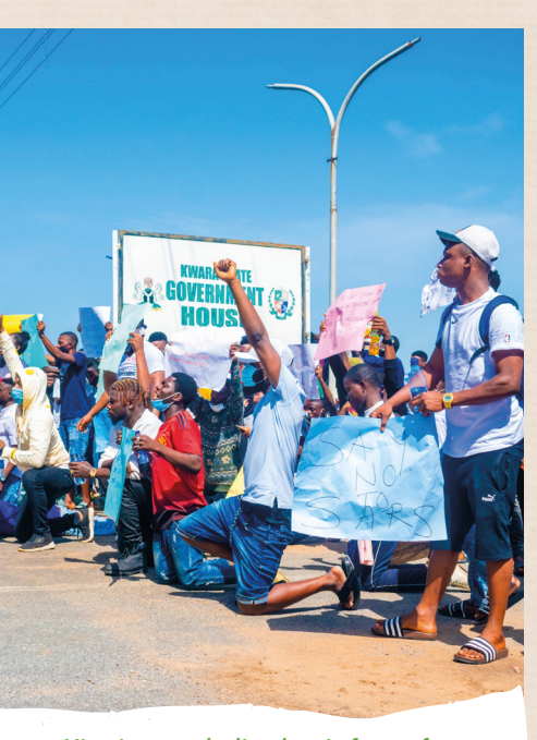
Nigerian youths lined up in front of the Kwara State Government House chanting songs and singing the Nigeria National Anthem with inscriptions #SayNOTOSARs.

"Nigerians who have been living through the #EndSARS protests recognise that it has been a trauma better not repeated, a pain one would never want to recall, and an eternal scar left on young people."