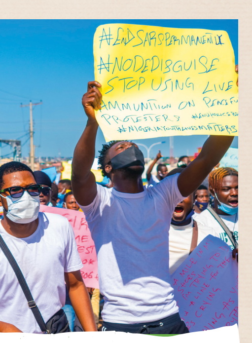
Young protesters with different inscriptions on placards, calling for an end to police brutality with the hashtag #NigeriaYouthLivesMatter.

"In the first two weeks of the pandemic lockdown, the police killed more people than the virus. This caused security and resources frustration amongst Nigerian youth, which contributed to the protests."